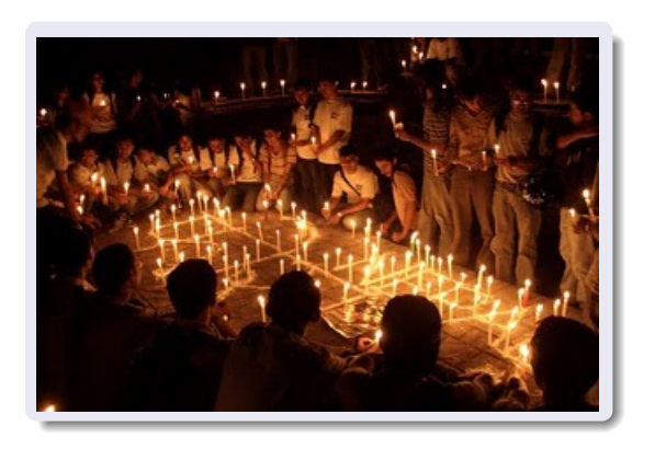
Software Freedom Day

Website: http://www.softwarefreedomday.org