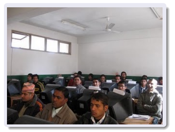
FOSS Research and Training Center

FOSS Essential Training Linux Terminal Server Project (LTSP) Linux Gyan